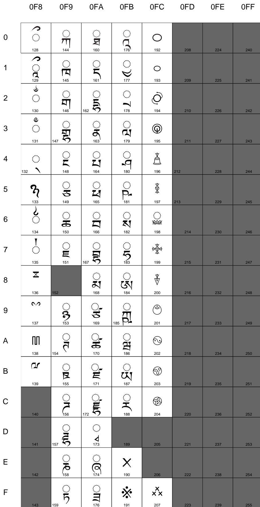
TABLE 249 - Row 0F: TIBETAN