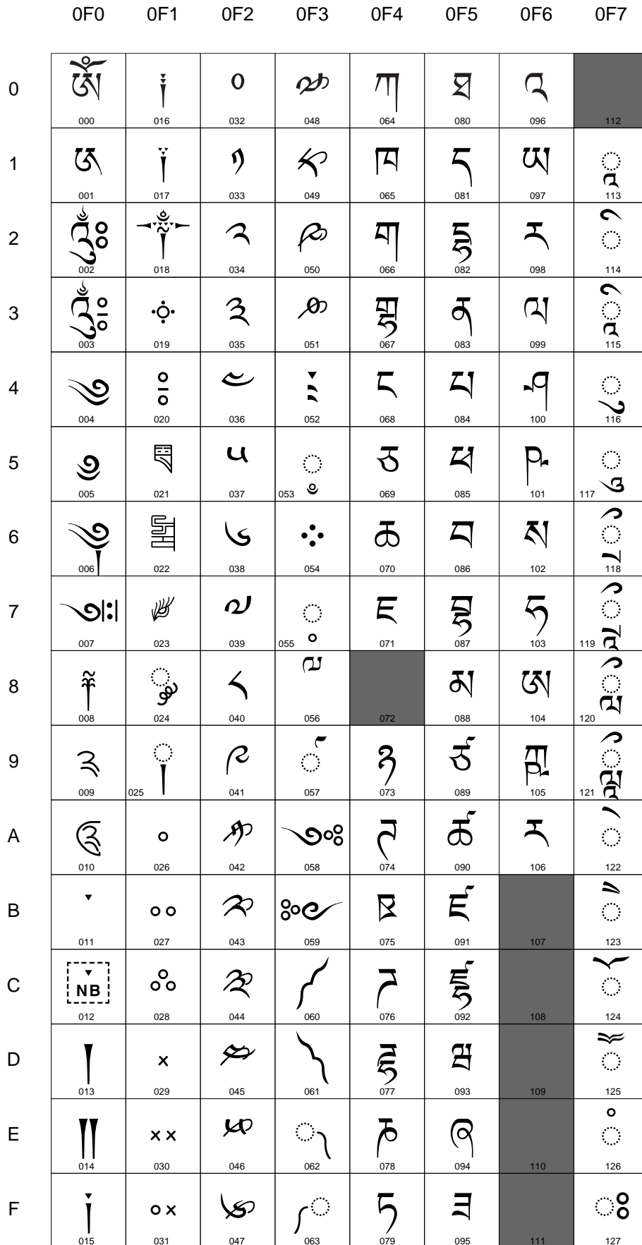
TABLE 248 - Row 0F: TIBETAN