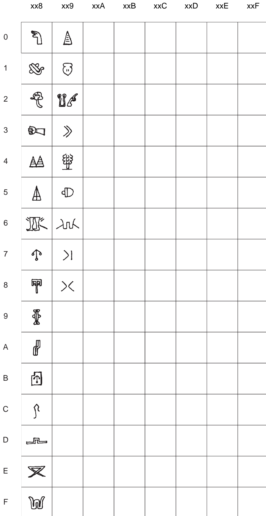
TABLE XXX - Row xx: ANATOLIAN HIEROGLYPHIC